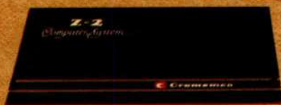
Z-2 is supplied for rack mounting. Attractive bench cabinet shown is also available.