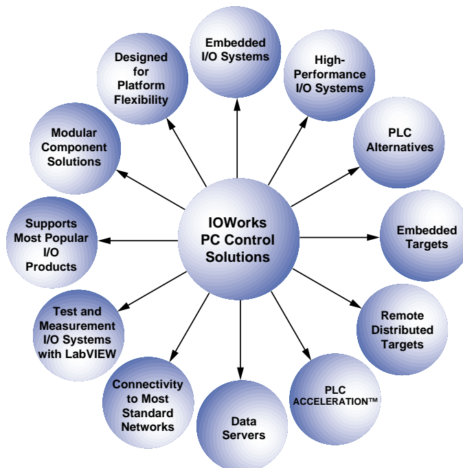
Figure 1. IOWorks Solutions for Your I/O Problems

IOWorks Access, IOWorks Manager, PLC ACCELERATION, and VMEmanager are trademarks and IOWorks, Visual IOWorks, and the VMIC logo are registered trademarks of VMIC. MMX is a trademark and Intel and Pentium are registered trademarks of Intel Corporation. Visual Basic, Visual C++, and Windows NT are registered trademarks of Microsoft Corporation. BootWare is a registered trademark of Lanworks Technologies, Inc. Other registered trademarks are the property of their respective owners.