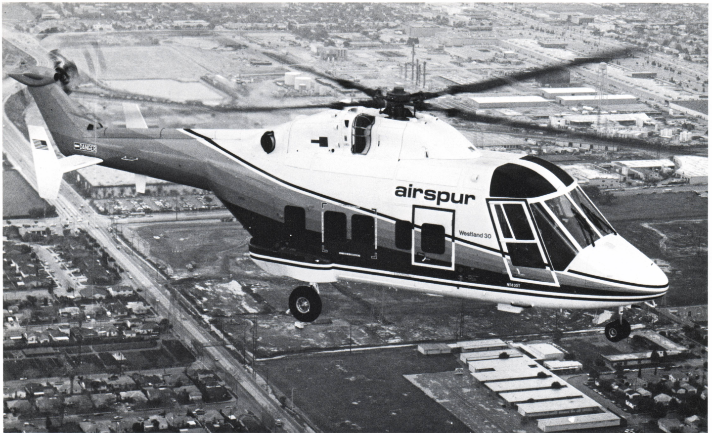
The Westland 30 is sold in the U.S. and should have the new composite blades by next year.