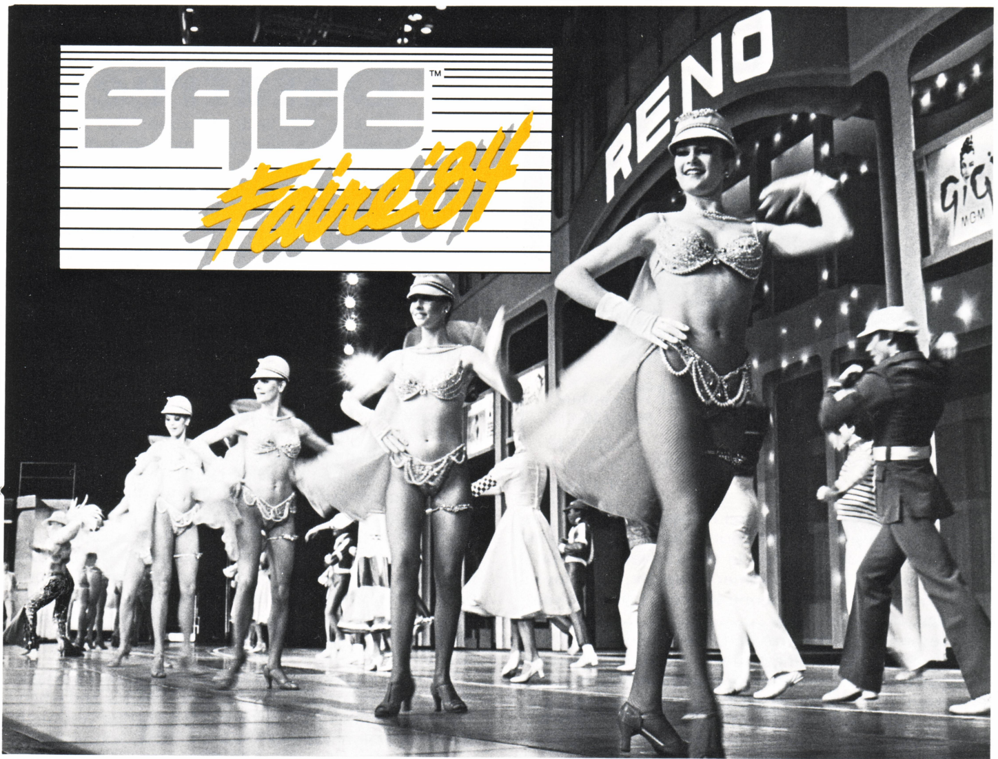
The Hello Hollywood Hello show at the MGM Grand Hotel is just one of the many entertainment opportunities you'll find in Reno at SAGE Faire '84.