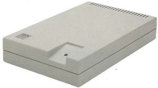
IBM 5178 PC Network Translator Unit