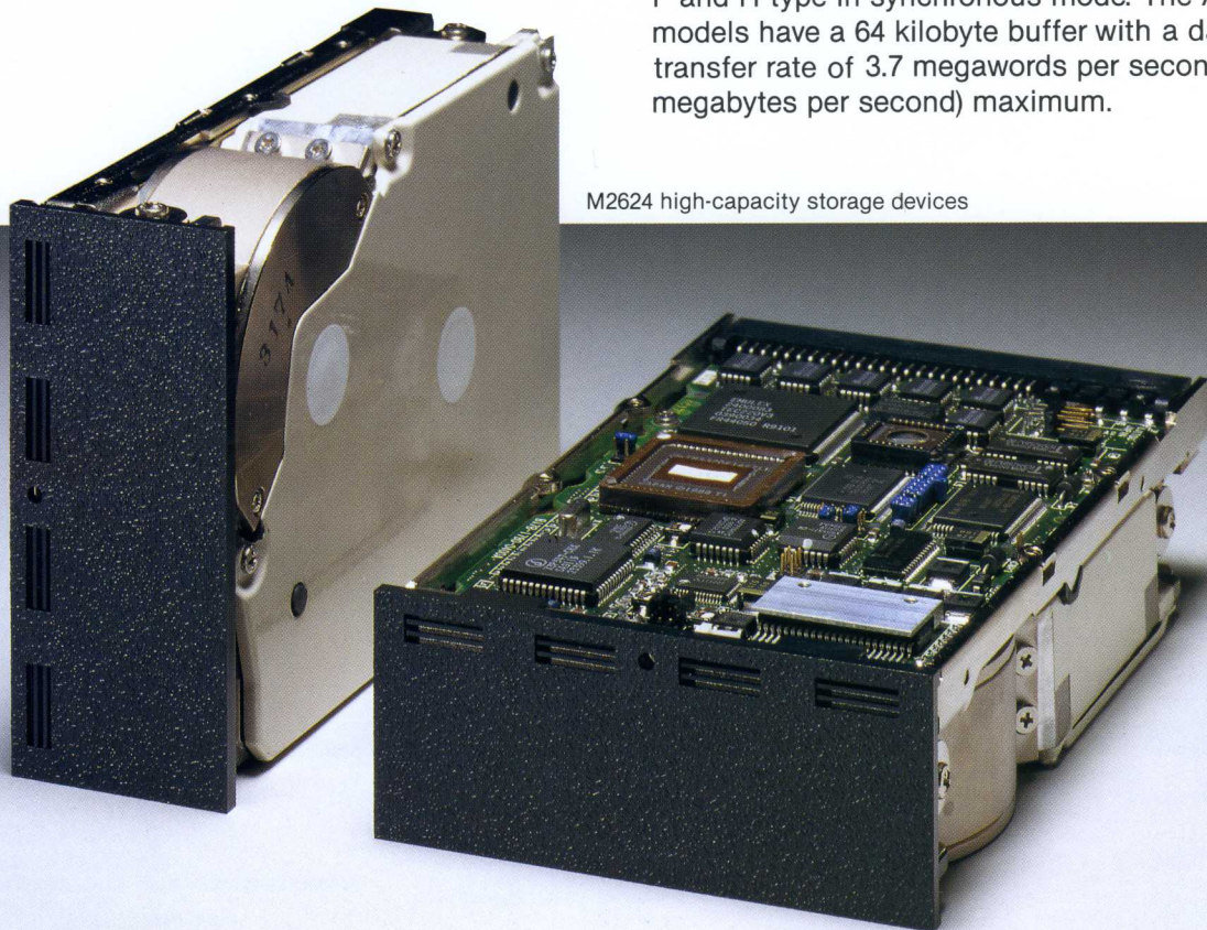
M2624 high-capacity storage devices

The M2622, M2623 and M2624 feature fast positioning times — 3-milliseconds track-to-track, 12 milliseconds average, and 25 milliseconds maximum, including settling time. Each SCSI interface model has a 240-kilobyte data buffer, which further improves the total transfer rate to 5 megabytes per second for S types and 10 megabytes per second for F and H type in synchronous mode. The AT interface models have a 64 kilobyte buffer with a data transfer rate of 3.7 megawords per second (7.4 megabytes per second) maximum.