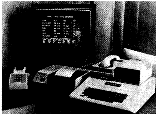
The Apple II Plus computer shown here is running under control of the Apple Stock Quote Reporter program. This program enables the system to be connected to a central data base, and receives a current display of stock prices and allows the operator to place a corresponding bid. Price of the 32KB RAM system as shown, with a printer, modem, 116KB mini-diskette drive, and user-furnished color TV is about $2,700 (not including the TV). A dial-up telephone connection must be made by the user to access current stock information from an on-line data base.

Business applications in general are certain to be among the most important future areas of usage for personal computers. Many small professional offices already use personal computers, and more will do so.