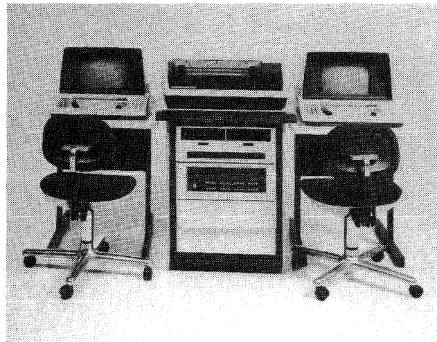
The Texas Instruments DS990 Model 2 utilizes a 990/5 micro-computer with 64K bytes of memory. The configuration pictured includes two 911 video terminals and an 810 printer. The double-sided, double-density diskettes drives are housed in the cabinet (center) just below the printer.

The TX5 operating system requires a DS990 Model 1, 990/5, or 990/10 computer with 64K bytes memory, 911 video display terminal or other I/O supported terminal, and a double-density flexible disk or DS10 disk.