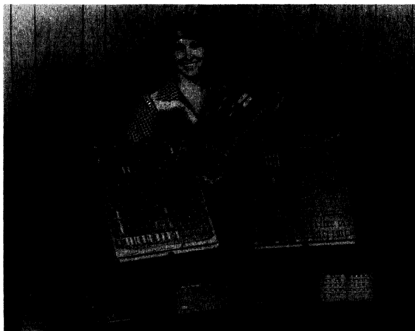
The LSI 4 family of processors includes the LSI 4/30, LSI 4/10, and LSI 4/90 (upper left to upper right). Packaged versions come in either an operator's console (lower left) or a programmer's console (lower right).